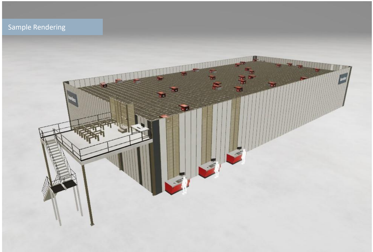
Sample 3D Rendering (Use the link above to view your customized rendering)